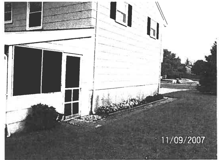
Left Side View – Date of Photograph: (See Photo Stamp)