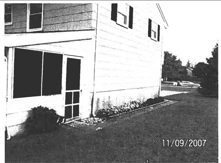
Left Side View – Date of Photograph: (See Photo Stamp)